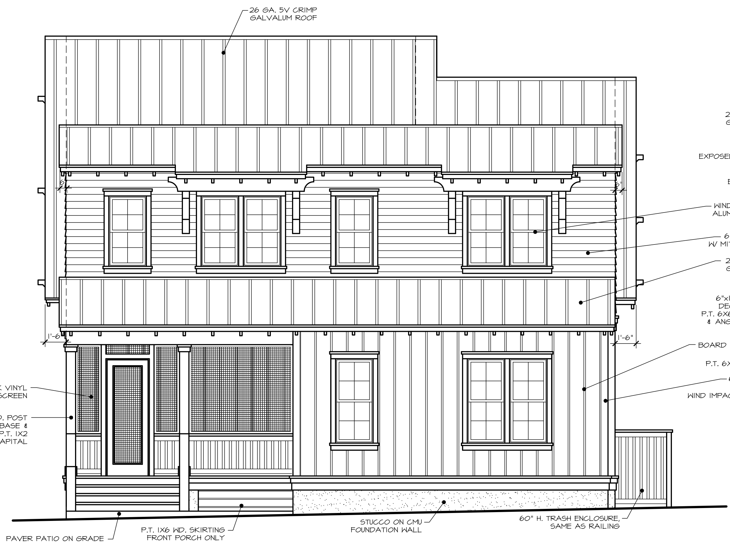
SOUTH ELEVATION 1/4" = 1'-0"