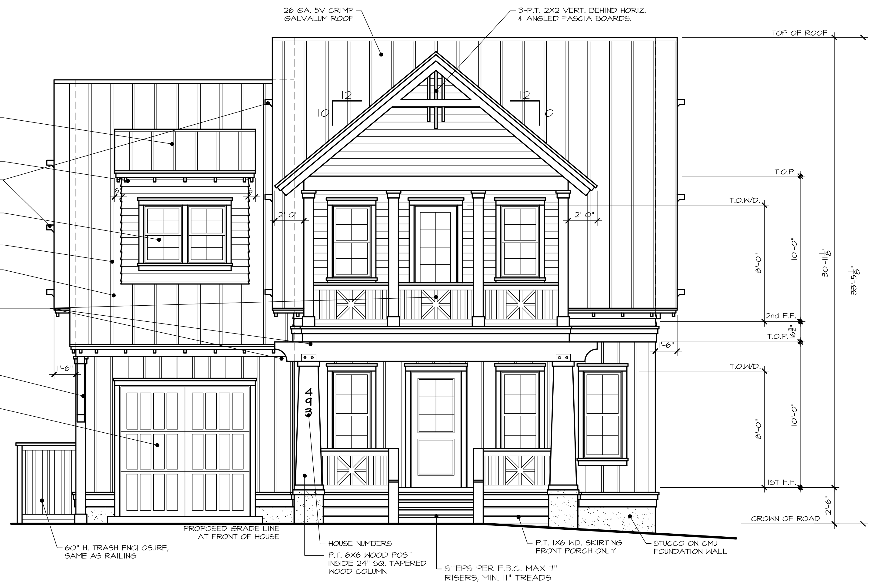
NORTH (STREET) ELEVATION 1/4" = 1'-0"